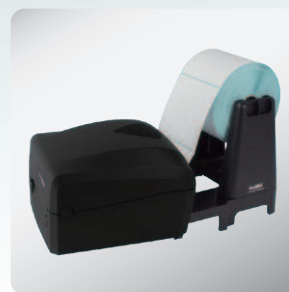
High cost-effectiveness for large amount printing