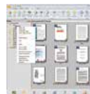
The PaperPort SE14 main screen

- The Professional Choice to Organize and Share Your Documents