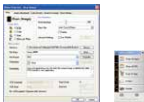
The Button Manager V2 main screen

Button Manager V2 makes it easy for you to scan and send your image to your favorite destinations with a press one button. Now the new version comes with an innovative feature to let you scan and automatically upload the scanned document to popular cloud repositories such as Google Docs, Microsoft SharePoint or FTP. In addition, the iScan feature allows you to insert the scanned image or recognized text after optional OCR (Optical Character Recognition) process to your text editor such as Microsoft Word to get your job done easily and quickly.