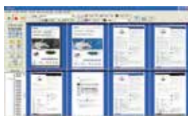
The AVScan X main screen

The Intelligent Document Management Tool