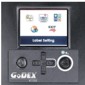
Color TFT LCD and operation panel for easy and intuitive operation

Full functions, powerful features, user friendly interface and high extensibility make the RT700i perfect for retail and industrial applications