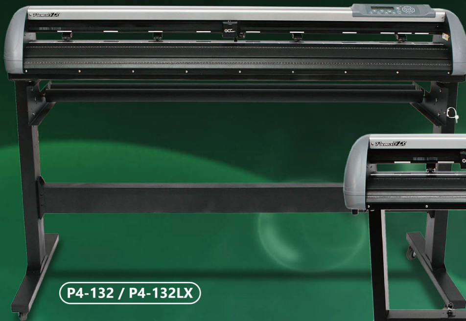
P4-132 / P4-132LX

Powered by a digitally controlled servo system, the Puma IV produces eye-catching graphics with up to 40 ips (1020 mm/sec) cutting speed, 500g of cutting force and 5 meters (16.4 feet) of tracking ability. Puma IV is the most reliable machine for sign makers.