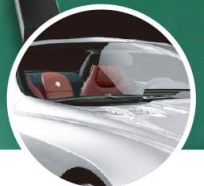
▶ Window Tint Film