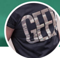
▶ Heat Transfer Film