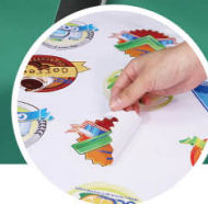
▶ Vinyl Sign/Custom Decal