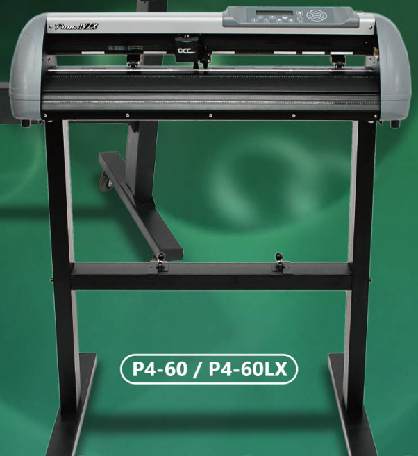
P4-60 / P4-60LX