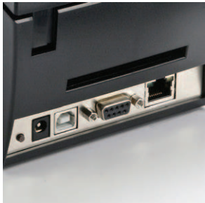
Ethernet, Serial and USB are standard features adding flexibility and power