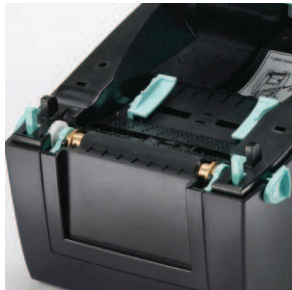
Full-range adjustable sensor enables printing on small and difficult labels