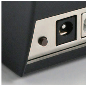
Innovative "C" button makes label Calibration simple and fast