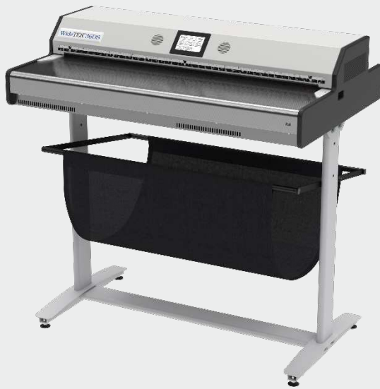
Side view of the WideTEK® 36DS with document collection basket. Scan stacks of newspaper pages without having to collect them each time they go through.

The scanner features two camera boxes, both consisting of three CCD systems, integrated into the upper and lower part of the device. WideTEK® 36DS captures both sides of the newspaper at the same time. After scanning, software separates the scanned document into four single images, capturing the left and right half of the front and back of the newspaper - everything in one single step.