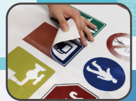
▶ Reflective Film / Sandblast Film