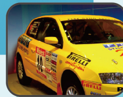
▶ PVC Vinyl / Window Tint Film/Paint Protection Film