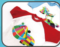
▶ Heat Transfer Film