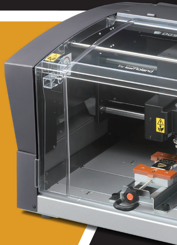
Model shown with optional centre vice

With remote machine management capabilities, the DE-3 offers USB and LAN connectivity for multiple machine engraving. Power up your production with the DE-3.