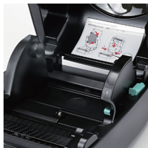
Rod-less label roll holder for easy loading and smooth feeding