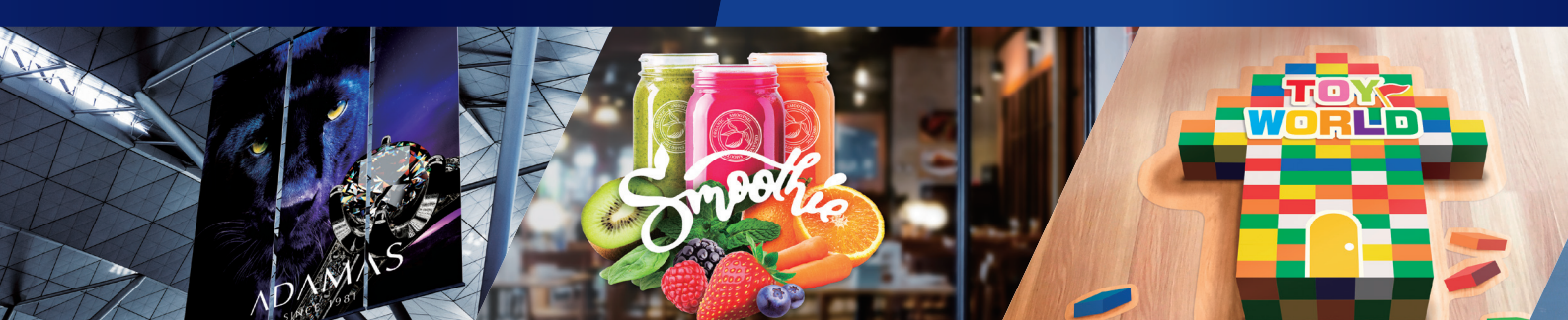
SG2 series (2 heads)