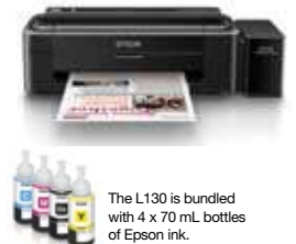
The L130 is bundled with 4 x 70 mL bottles of Epson ink.

Superb Savings and Page Yield A low-cost bottle of black ink delivers an ultra-high yield of 4,500 pages for substantial savings.