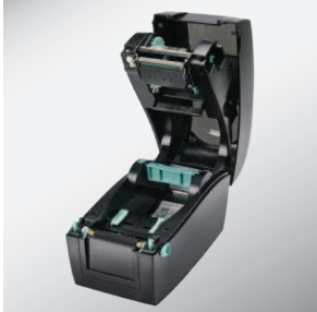
Modern clam-shell design makes it simple to load labels