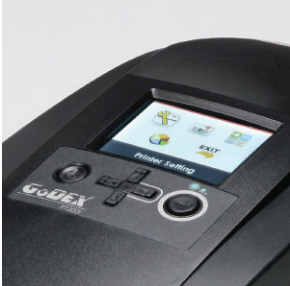
Color TFT LCD and operation panel for easy and intuitive operation

The RT200i barcode printer is packed with performance enhancing features that makes it the most powerful 2" thermal transfer printer