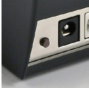
Innovative "C" button makes label Calibration simple and fast