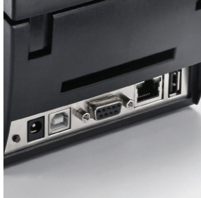
Ethernet, USB 2.0, Serial and USB host are standard features adding flexibility and power