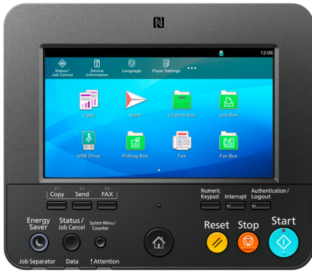
TASKalfa 508ci / 408ci / 358ci control panel