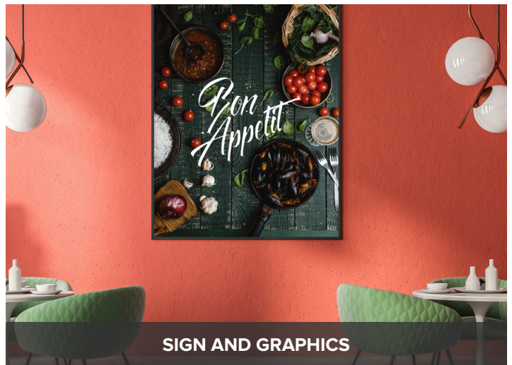
SIGN AND GRAPHICS