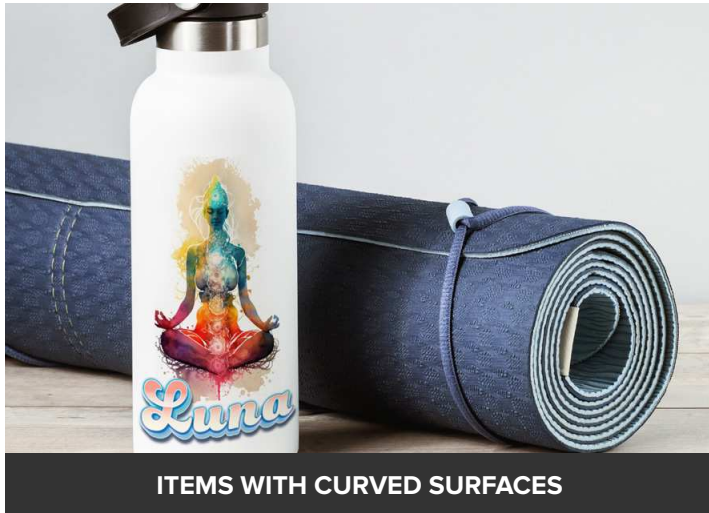
ITEMS WITH CURVED SURFACES