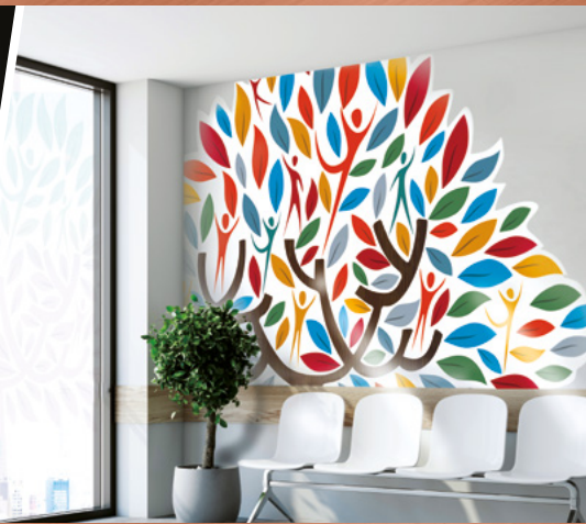
WINDOW AND WALL GRAPHICS