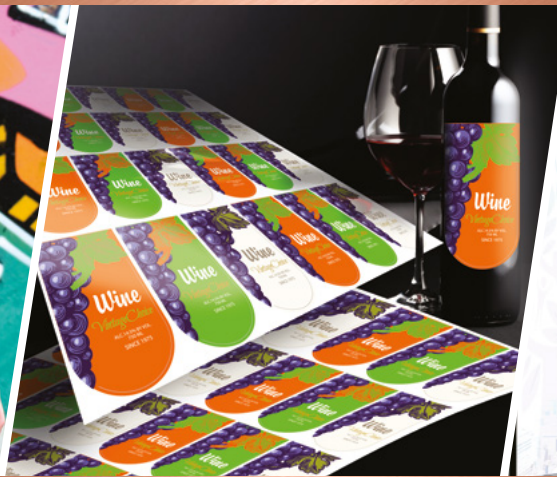
CONTOUR CUT LABELS