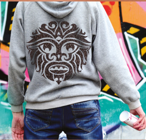
HEAT TRANSFER APPAREL