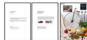
#1 Black Text #2 Colour #3 Photo 4R

#1 Print speed (Pages Per Minute) is calculated when printed on A4 plain paper in the fastest mode, 10 x 15 cm photo print speed when printed on Epson Premium Glossy Photo Paper. Print speed may vary depending on system configuration, print mode, document complexity, software, type of paper used and connectivity. Print speed does not include processing time on host computer.