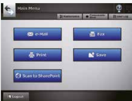
Main Menu screen

An SDK is available for the N7100 to further meet the needs of your business. This SDK will enable developing a connector to a preferred third-party application, may that be a DMS, ECM, BPM or ERP system. This connector in turn is uploaded to the N7100 and then acts as a one button door opener into the productive target systems. The SDK additionally provides for utilising IC readers attached to the network scanner's USB port.