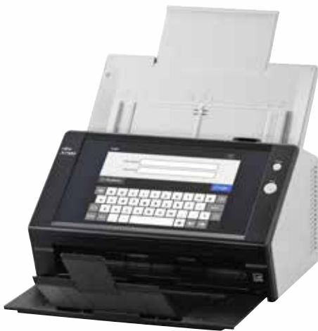
A4 Portrait at 300 dpi 25 ppm / 50 ipm Scan mixed batches up to 50 sheets