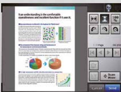
Preview screen (Scan viewer)