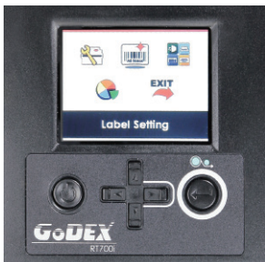
Color TFT LCD and operation panel for easy and intuitive operation

Full functions, powerful features, user friendly interface and high extensibility make the RT700i perfect for retail and industrial applications