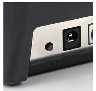
Innovative "C" button makes label Calibration simple and fast