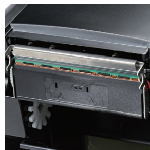
"Twin-Sensor" technology allows you to use a broad range of labels