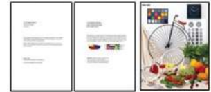
#1 Black Text #2 Colour #3 Photo 4R

*1 Print speed (Pages Per Minute) is calculated when printed on A4 plain paper in the fastest mode, 10 x 15 cm photo print speed when printed on Epson Premium Glossy Photo Paper. Print speed may vary depending on system configuration, print mode, document complexity, software, type of paper used and connectivity. Print speed does not include processing time on host computer.