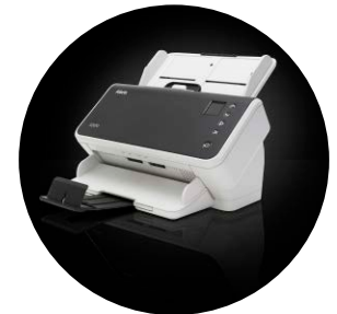
Alaris S2040/S2070 Scanners