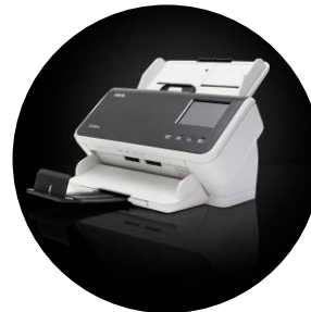
Alaris S2060w/S2080w Scanners