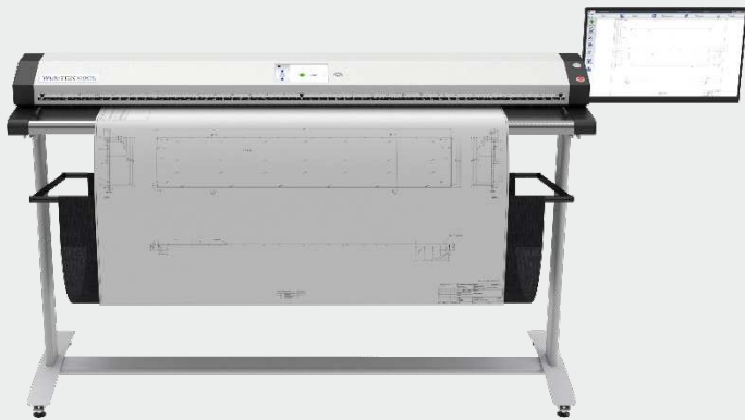
Large documents like maps rewind to the front or fall into the paper catch.

The WideTEK® 60CL produces extraordinarily sharp images, with color accuracy even superior to competing CCD scanners. Document rotation is done on the fly, a scan of an E-sized / A0 document in landscape at 300 dpi in 24bit color takes less than 7 seconds to scan and another 2 seconds to crop & deskew, preview and store.