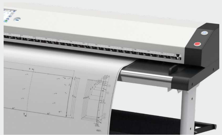
A USB 3.0 port lets you take away your scanned images on a USB device.