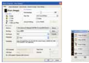
The Button Manager V2 main screen

Button Manager V2 makes it easy for you to scan and send your image to your favorite destinations with a press one button. Now the new version comes with an innovative feature to let you scan and automatically upload the scanned document to popular cloud repositories such as Google Docs, Microsoft SharePoint or FTP. In addition, the iScan feature allows you to insert the scanned image or recognized text after optional OCR (Optical Character Recognition) process to your text editor such as Microsoft Word to get your job done easily and quickly.