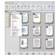
The PaperPort SE14 main screen

- The Professional Choice to Organize and Share Your Documents