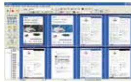
The AVScan X main screen

The Intelligent Document Management Tool