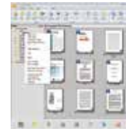
PaperPort SE 14

- The Professional Choice to Organize and Share Your Documents