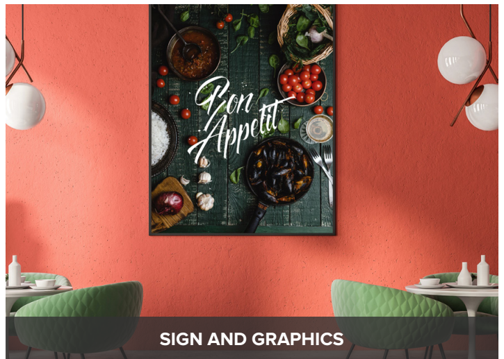
SIGN AND GRAPHICS