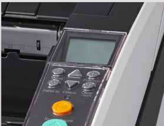
Integrated LCD operating panel

Fujitsu's fi-7800 and fi-7900 deliver the complete scanning solution. A combination of our market-leading scanner, software and service give you everything needed for a more productive system and more productive people, allowing you to focus more on your business and less on your technology.