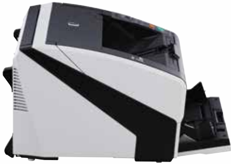
fi-7800 – A4 Landscape at 300 dpi 110 ppm / 220 ipm fi-7900 – A4 Landscape at 300 dpi 140 ppm / 280 ipm Scan mixed batches through the 500 sheet ADF