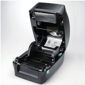
Modern clam-shell design makes it simple to load labels

Advanced multi-purpose 4" desktop printer for light to medium duty applications. With its powerful and reliable features, RT700 is the best choice for retail and industrial applications