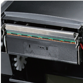
"Twin-Sensor" technology allows you to use a broad range of labels