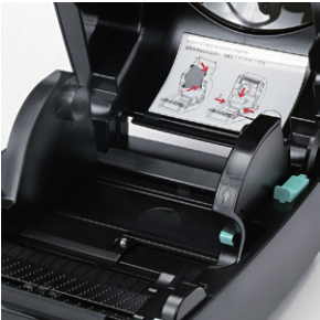
Rod-less label roll holder for easy loading and smooth feeding