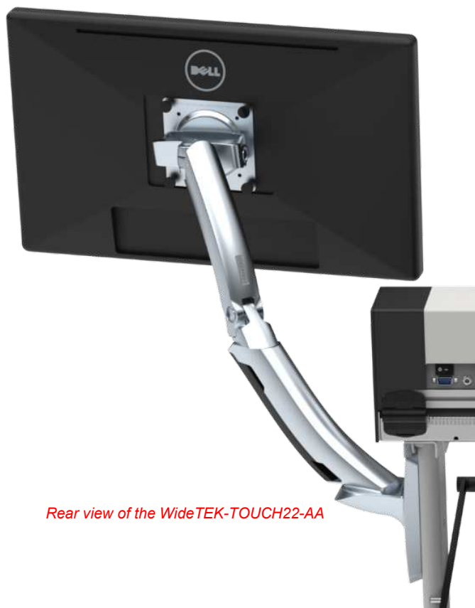
Rear view of the WideTEK-TOUCH22-AA