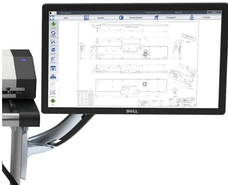
Full HD monitor with adjustable monitor arm mounted to the side of a WT36/48/60-STAND