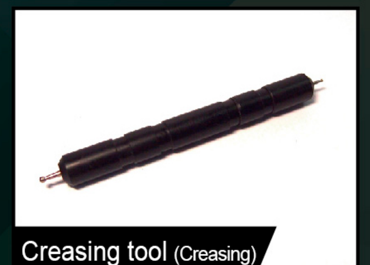
Creasing tool (Creasing)