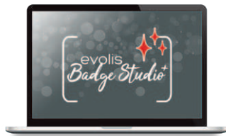
Evolis Badge Studio® card designer software