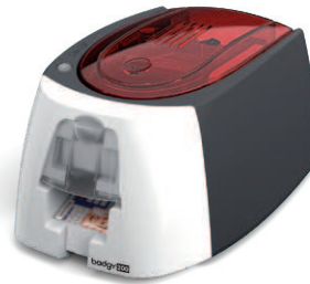
Badgy card printer