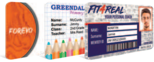
Online card template library