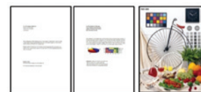
#1 Black Text #2 Colour #3 Photo 4R

#1 Print speed (Pages Per Minute) is calculated when printed on A4 plain paper in the fastest mode, 10 x 15 cm photo print speed when printed on Epson Premium Glossy Photo Paper. Print speed may vary depending on system configuration, print mode, document complexity, software, type of paper used and connectivity. Print speed does not include processing time on host computer.