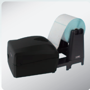
High cost-effectiveness for large amount printing