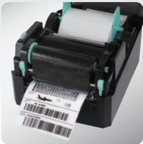
Uses standard low-cost labels and ribbons