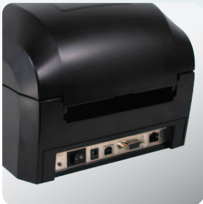
Ethernet, Serial and USB ports included

Use the GE300 for all you light to medium duty thermal transfer barcode printing applications