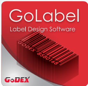
Free labeling software GoLabel for easy printing